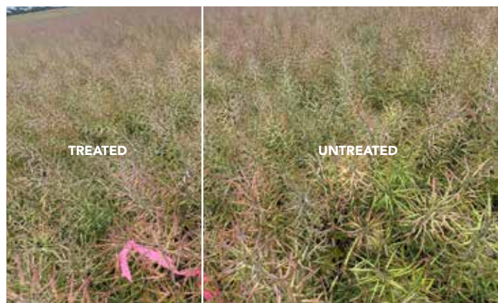
Res+ canola trial - treated and untreated