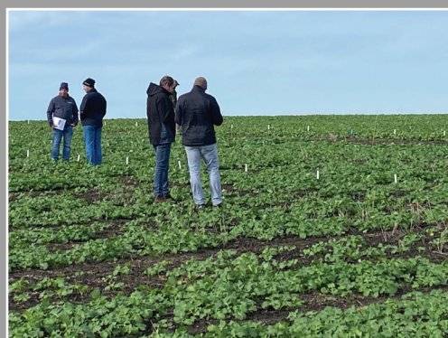
Lumen Canola Trial