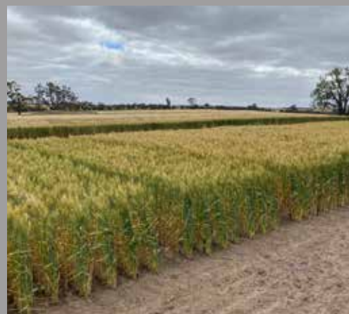
Site overview photo highlighting responses of various treatments.