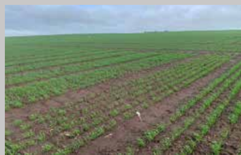
Site overview photo highlighting responses of various treatments.