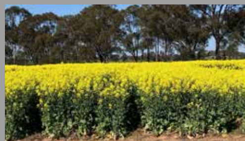
Site overview photo highlighting responses of various treatments.